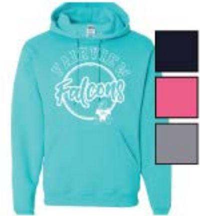
Vintage heather navy, neon pink, scuba blue or oxford gray hoodie with distressed logo $23.00