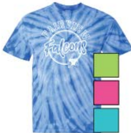
Lime Green, Royal Blue, Fuchsia or Turquoise tie dye T-shirt with circular distressed logo. $16.50