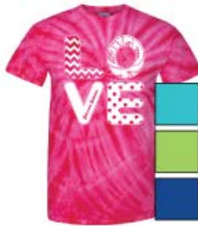
Fuchsia, Turquoise, Lime Green or royal blue tie dye T-shirt. $16.50