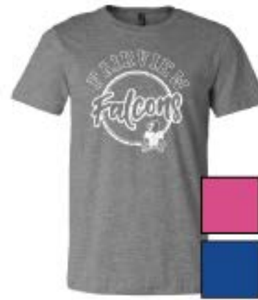
Royal, Deep Heather or Berry Canvas soft style T-shirt with distressed logo. $12.50