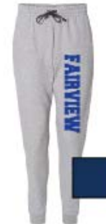
Athletic heather or navy jogger sweatpants. $19.50