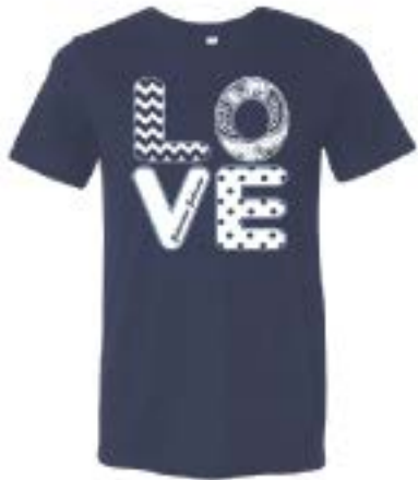
Navy super soft Canvas tri-blend T-shirt. $15.00